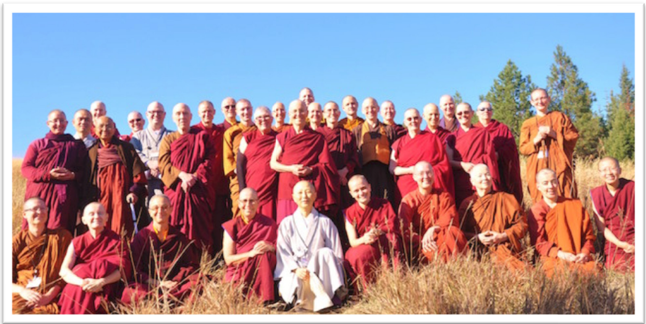
The 21st annual Western Buddhist Monastic Gathering, held at Sravasti Abbey in October, 2015.